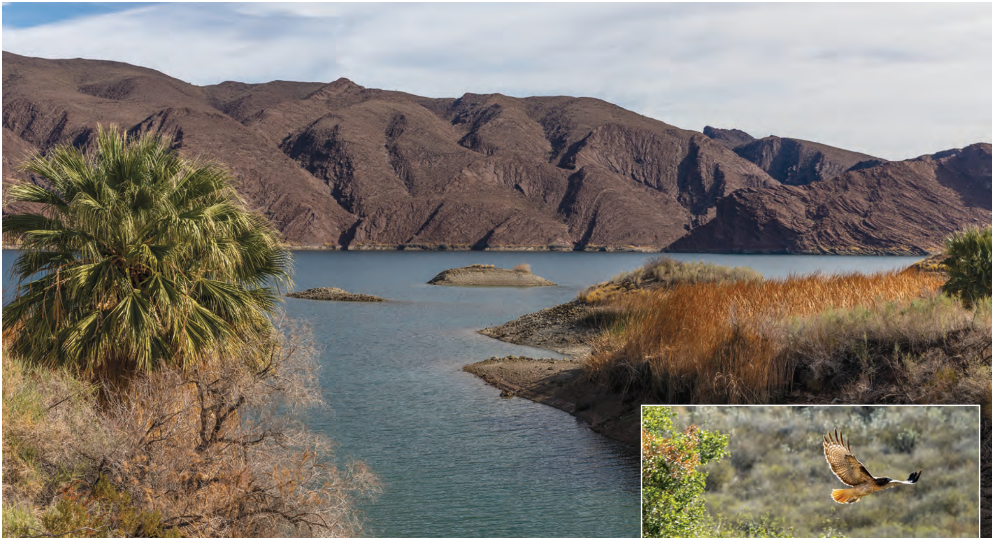
Metropolitan supplies water to 19 million Southern Californians and also preserves habitats around reservoirs such as Copper Basin, shown above, that support wildlife such as the red-tailed hawk shown at right. Metropolitan encourages conservation and efficiency as the region adapts to climate change.