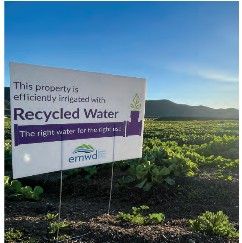
At left, EMWD’s Perris II Desalination Facility was commissioned in 2022 and provides enough clean drinking water for 15,000 households each year. Above, EMWD in 2022 continued to be a state leader in providing recycled water service to the community. EMWD sold more than 39,000 acre-feet of recycled water in fiscal year ending 2022, with approximately two-thirds of that to its agricultural customers.