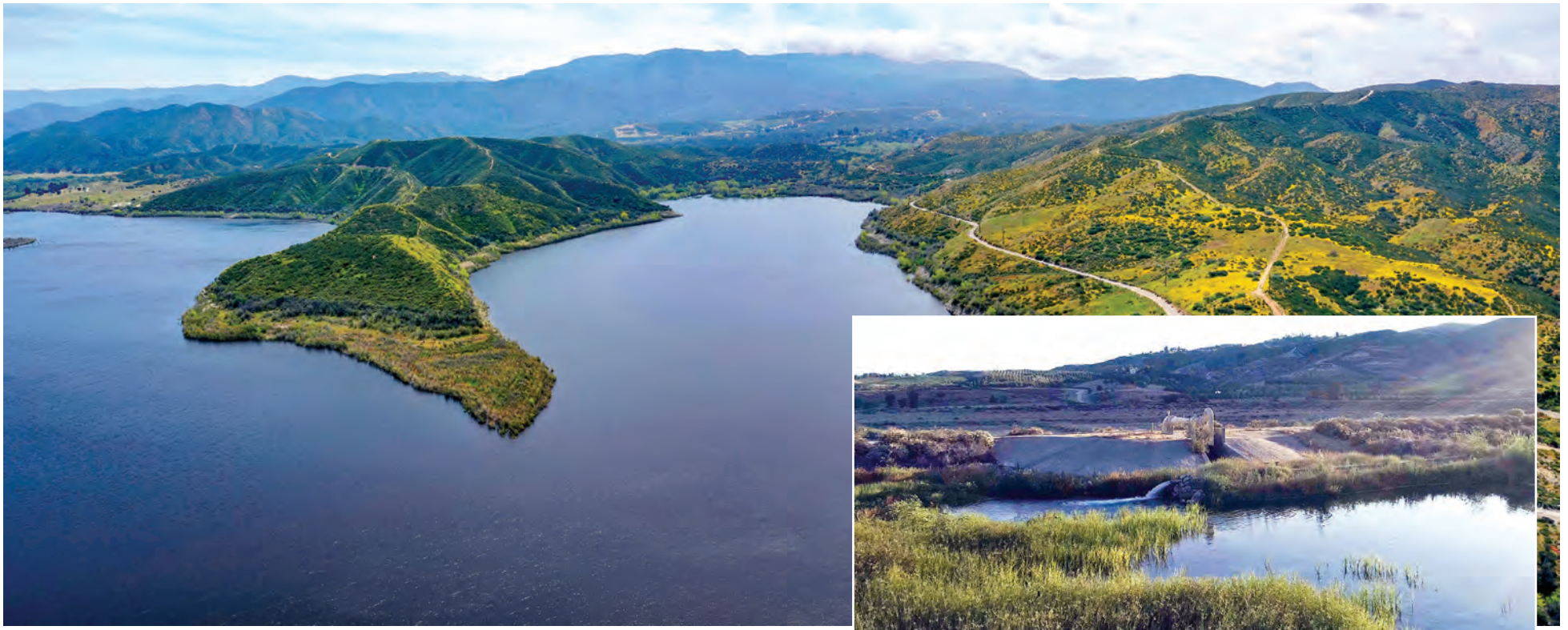
Vail Lake, shown above, captures local rainfall and can store up to 14.7 billion gallons of water. Inset at right: Future location of hydroelectric facility at Upper VDC Recharge Basin.