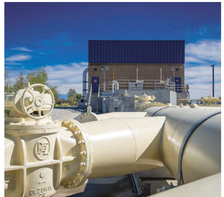
Recycled water is a critical component of IEUA's resource management. IEUA's recycled water program delivers more than 30,000 APY. The Agency is currently expanding the capacity of RP-5, shown above and at left.

Recognizing that the future of the region's resiliency relies on local reliability, IEUA is growing its recycled water capacity with the expansion of Regional Water Recycling Plant No. 5 (RP-5), which has been in operation since 2004. RP-5 currently only treats liquids and has a capacity of 16.3 million gallons per day (mgd). The RP-5 Liquids Treatment Expansion project will expand RP-5's liquid treatment capacity to 22.5 mgd and will include infrastructure for RP-5's ultimate buildout to treat an average flow of 30 mgd and a peak flow of 60 mgd.