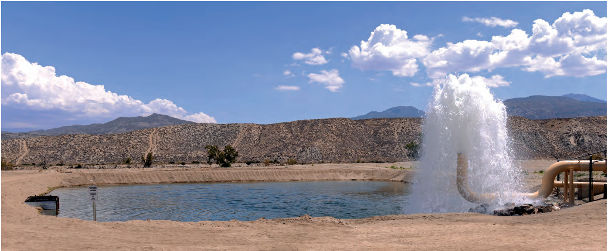
EMWD replenishes groundwater in the San Jacinto Valley during wet and normal years so that it has an increased supply of local groundwater supplies available during cyclical dry conditions. Below, EMWD uses recycled water for public landscaping, including at golf courses and in common areas of homeowners associations landscaping.