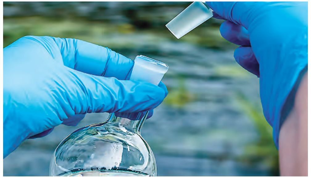
Fontana Water Company has provided safe, clean and reliable water service to the City of Fontana for over 75 years.