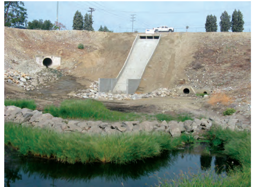
At left is the Montclair Basin Chain shown full after a March 2023 storm. The Montclair Spillway #2, shown above, at its completion.