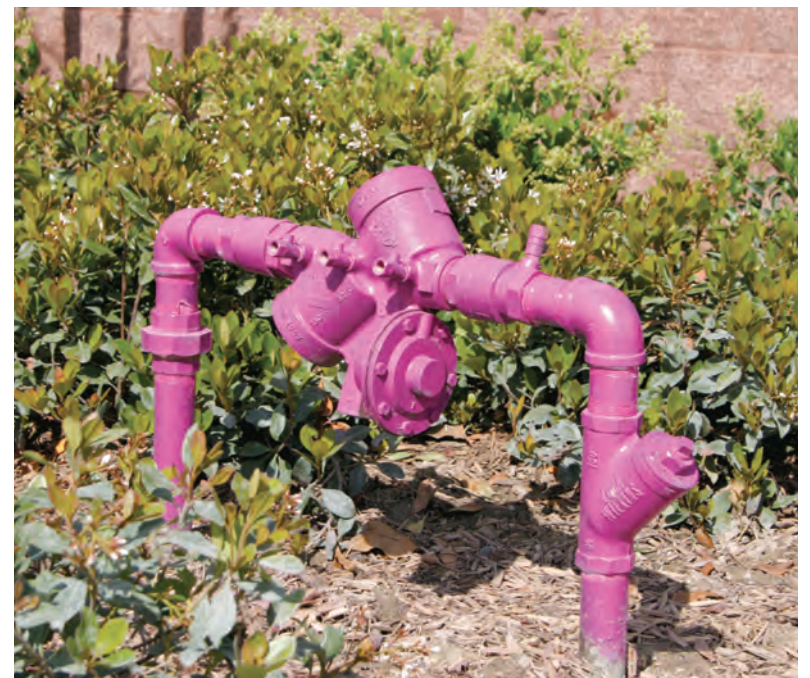
Jurupa Community Services District (JCSD) will break ground later this year on a Regional Recycled Water Project that will bring recycled water to parks, schools and street landscapes in Eastvale and Jurupa Valley. Communities will start seeing purple pipes, shown above, and signs indicating the use of recycled water.